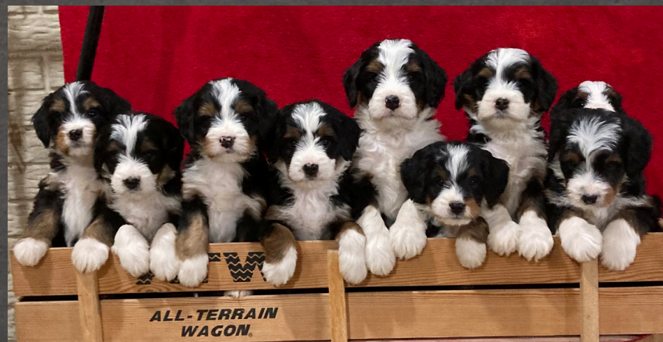
Mini Bernedoodles from Bernese